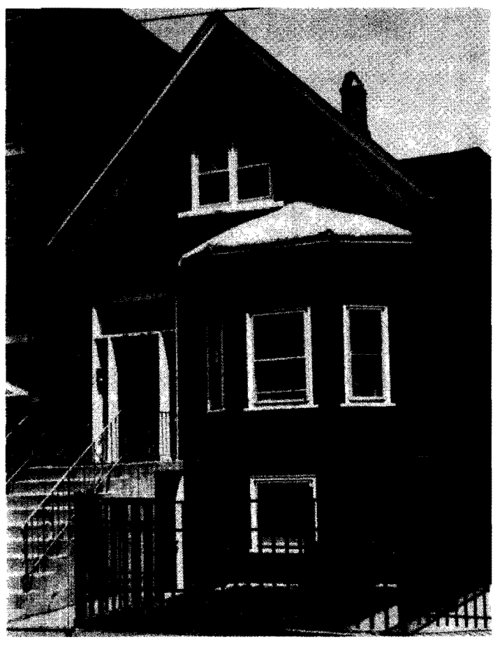
Two of the Chicago group homes studied here appear above.